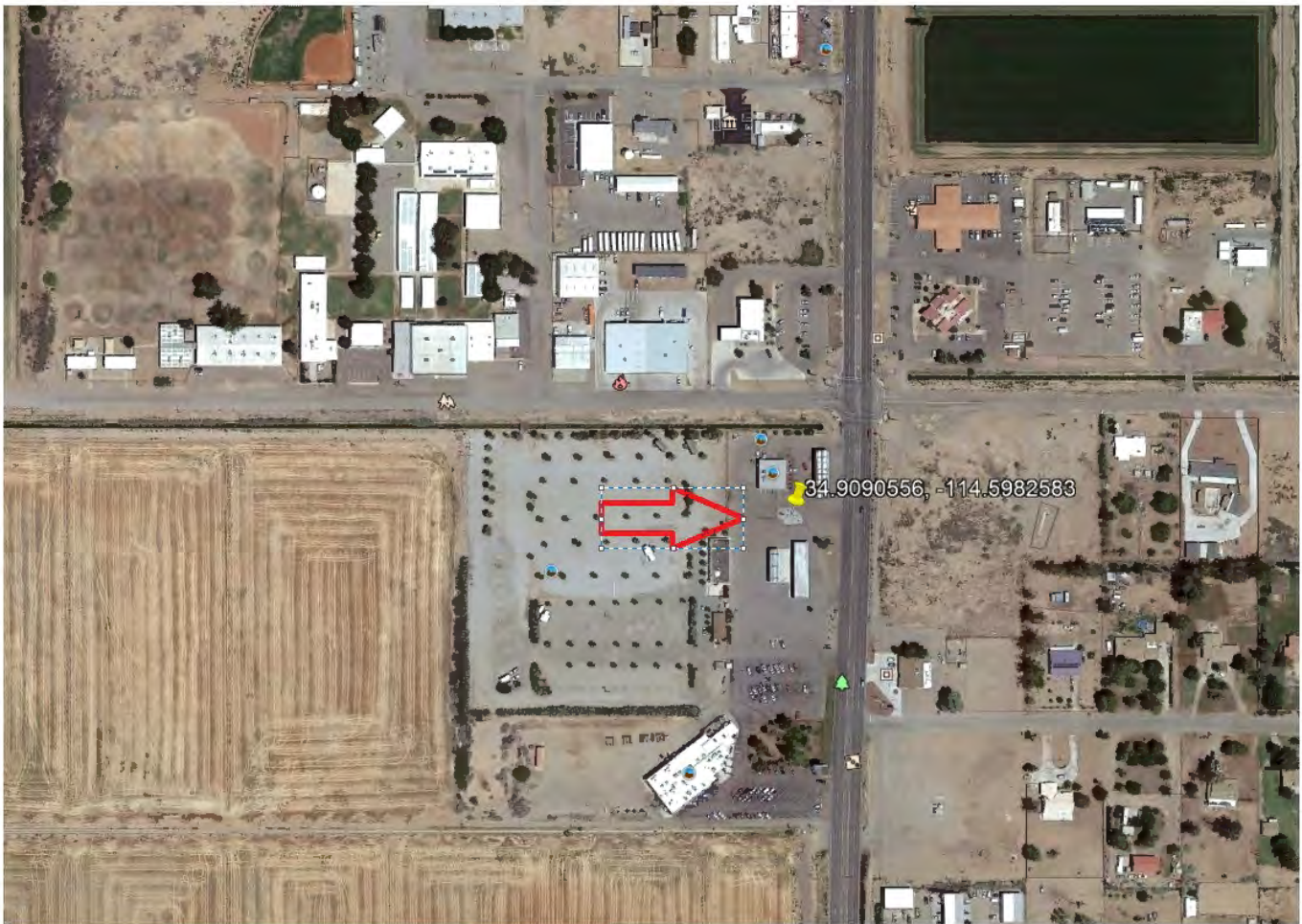
Figure 1: Location of old USTs

Former Amoco-Ft Defiance is located on Kit Carson Drive in Ft Defiance Latitude 34.9090556, Longitude -114.5982583